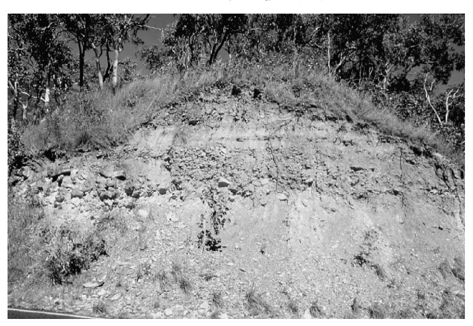
Fig. 1. Coarse fanglomerate, N of Cairns, NE Queensland, Australia. Coarse angular blocks dominate scarpfoot fans derived from short, steep catchments (slopes >27^{\circ} ) with no saprolite cover.