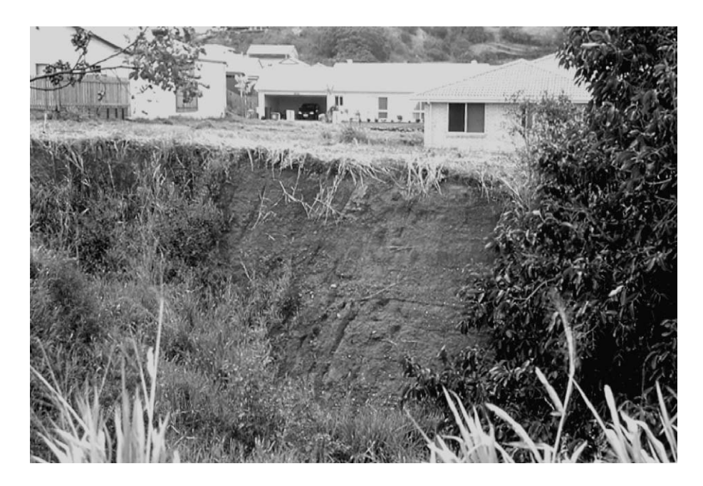
Fig. 2. Fine laminated sediments, S of Cairns, NE Queensland, Australia. These sediments resemble colluvium and are dominated by sandy clays derived from scarpfront saprolite stores (slopes generally <20^{\circ} ).