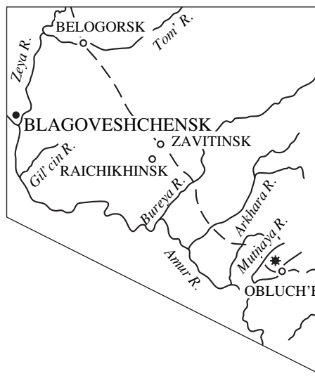
Fig. 1. A map of part of the Amur Region. Designation: * Kundur locality.

Materials described in this report include three bones: specimen AEIM, no. 2/1, a tooth with a slightly damaged anterior edge, a worn labial crown surface, and a broken off root (Figs. 2a, 2b); specimen AEIM, no. 2/2, an incomplete tooth, including the basal part of the crown and the root base (Figs. 2c, 2d); and specimen AEIM, no. 2/16, an osteodermal scute (Fig. 3). All bones come from the deposits of the Udurchukan (the lowermost part of the Tsagayan) Formation of the Kundur locality (Arkharinskii District, Amur Region, Russia).