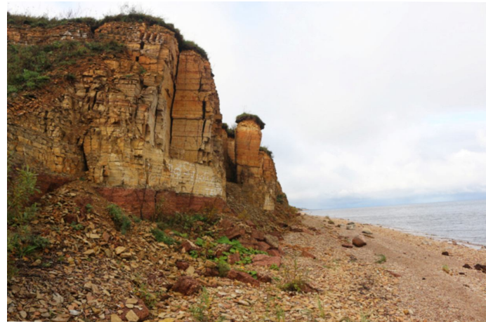
Fig.2. An exposure of the Buregskaya Formation on the shores of Lake Il'men. The cliff is 6-8metres high

area. Murchison had played a fundamental role in recognizing and establishing not only the Silurian System based on sequences in Wales and the Welsh Borderland, but also the Devonian system based on rocks in the county of Devon in south-west England. But at the time of his visit to Russia Murchison had a significant problem in establishing the Devonian as a separate system and which was proving very controversial. In Scotland there was clearly terrigenous Old Red Sandstone sediments with distinctive fossil fish, whereas in Devon there were limestones with brachiopods and corals that were somewhat intermediate between the comparable Silurian and Carboniferous faunas. Murchison had visited continental Europe in the summer of 1839 and importantly had met von Buch in Berlin and studied his collection of Russian fossils. These discussions and the fossil collection provided the impetus for Murchison to see the Russian sections for himself.