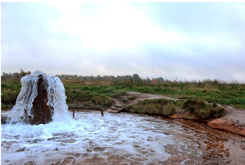
Fig.8. Flowing well from Middle Devonian aquifer near the spa town of Staraya Russa

There are many artistic works associated with the lake. The 19 th century Russian composer Nikolai Rimsky-Korsakov set much of the action for his famous opera «Sadko» in Novgorod and on the shores of Lake Il'men and in the legendary realm of the sea king. «Sadko in the underwater Kingdom» is a famous painting by Ilya Repin, the distinguished Russian artist.