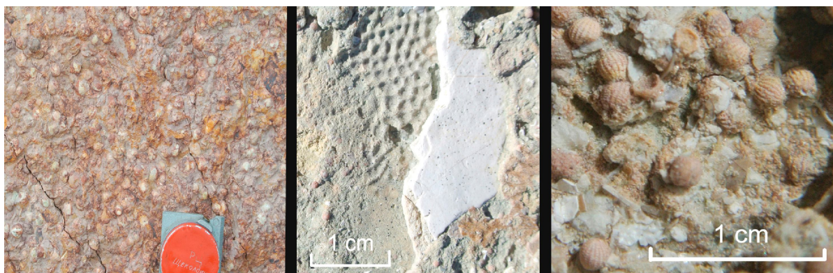
Fig. 7. Fossils from the Il'men Clint; from left to right: brachiopod bed; a plate of an armoured placoderm fish; and oogonia from the chlorophyte alga Chara

The overlaying Buregskaya Formation is composed mostly of brown argillaceous platy and in some cases dolomitized limestones. Its basal part contains numerous brachiopods such as productids, spiriferids and atrypids and also bivalves, gastropods, cephalopods, algae and conodonts plus crinoidal and bryozoan fragments. Plates of large placoderm fish are also found in this part of the succession. Abundant trace fossils and rare moulds of bivalves and gastropods characterize various parts of the platy limestones. In the middle and towards the top of the formation the limestone shows wavy/lense-like bedding and a paler color and at the top of the formation there are nodular limestones with rare brachiopods, ostracods and trace fossils. The limestones of the Buregskaya Formation also show a series of clinoform structures [15]. The faunas of the Buregskaya Formation in some cases show a rare mixing of Devonian marine and «terrestrial» faunas. It was the recognition of this mixed assemblage that provided the proof for the Devonian System at close-by localities on the Volkoff River that were visited by Murchison, de Keyserling and Koksharov.