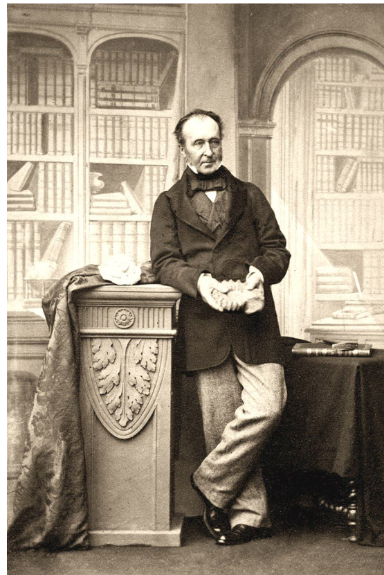
Fig.6. Sir Roderick Impey Murchison (1792-1871), pioneer geologist who was amongst the first to describe the Devonian faunas of the Lake Il'men region