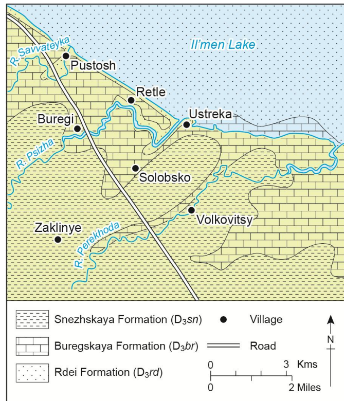
Fig.5. Geology of part of the Il'men Clint area [8]

The geology of the site consists of a complex