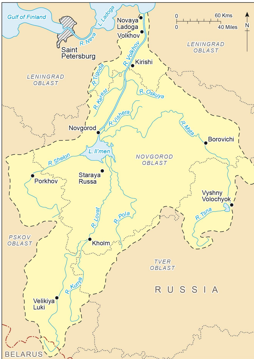
Fig.1. The River Volkhov-Lake Il'men drainage basin (after A.F.Safronov)

post-glacial deposits. The Quaternary complex is represented by upper Pleistocene sediment, of glacial, glaciolacustrine and glaciofluvial origin, and Holocene deposits derived from lakes, rivers and marshes.