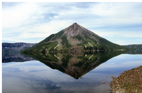
FIGURE 3 Kol'tsevoye lake located in Tao-Rusyr caldera. Since the caldera formed 7500 years ago, Krenitzin Peak stratovolcano has formed in the central part of the caldera. The 1952 crater and the lava dome are visible on the slope and at the foot of the volcano.

The Kuriles, in general, have a maritime monsoon climate influenced by sea currents (both cold and warm, Fig. 1) of the Pacific Ocean and the Sea of Okhotsk, as well as by air masses coming from eastern Asia or the Bering Sea region. The southern part of the Sea of Okhotsk is under the influence of the warm Soya sea current, whereas the cold Kamchatka current travels south along the Pacific coast. As a result, the climate of the western slopes of the largest southernmost islands, warmed by the Soya current and protected by high ridges from the cold Pacific, is close to subtropical. The climate of the eastern slopes is notably colder, resulting in strikingly different vegetation. The northernmost islands