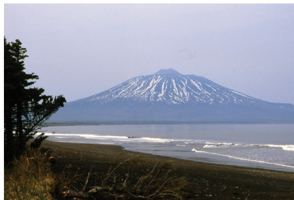
FIGURE 2 Tyatya volcano, Kunashir Island. View from the southeast from the Pacific coast.

Although rivers and lakes are common on the larger Kurile Islands, several small islands have no sources of drinking water. Island rivers are commonly short and rapid (whitewater rivers) with many waterfalls. The 140-m high Ilia Murometz waterfall on Iturup is one of the highest in Russia. Many of the lakes are located in volcanic craters and calderas. The deepest (>264 m) and most beautiful is Kol'tsevoye (Circular) Lake (Fig. 3), which is located inside the Tao-Rusyr caldera at Onkotan Island. Some lakes and rivers located in