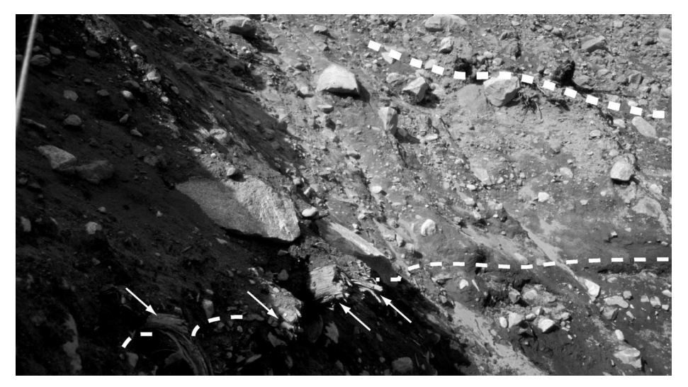
Figure 2. Dated logs (arrows; A.D. 540–770) and paleosol (thin dashed line; A.D. 420–620) buried by till during first millennium A.D. glacier advance at Lillooet Glacier in southern Coast Mountains (Reyes and Clague, 2004). Thick dashed line marks wood layer and paleosol developed on first millennium A.D. till that was buried during Little Ice Age glacier advance. Buried surfaces are separated by 4–6 m of vertical distance.

trital and/or in situ wood and commonly associated with a paleosol is covered by glacial sediments dating to the first millennium A.D. (Fig. 2). A similar buried surface typically separates these glacial sediments from overlying Little Ice Age till or outwash.