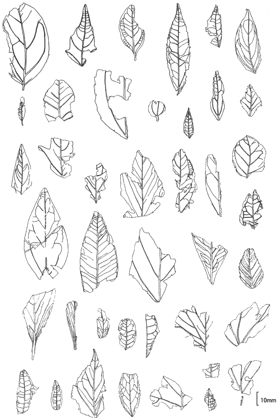
Fig. 3. Line drawings showing the venation features of the morphotypes identified in the floras discussed here. For detailed descriptions of each morphotype see Hayes (1999).