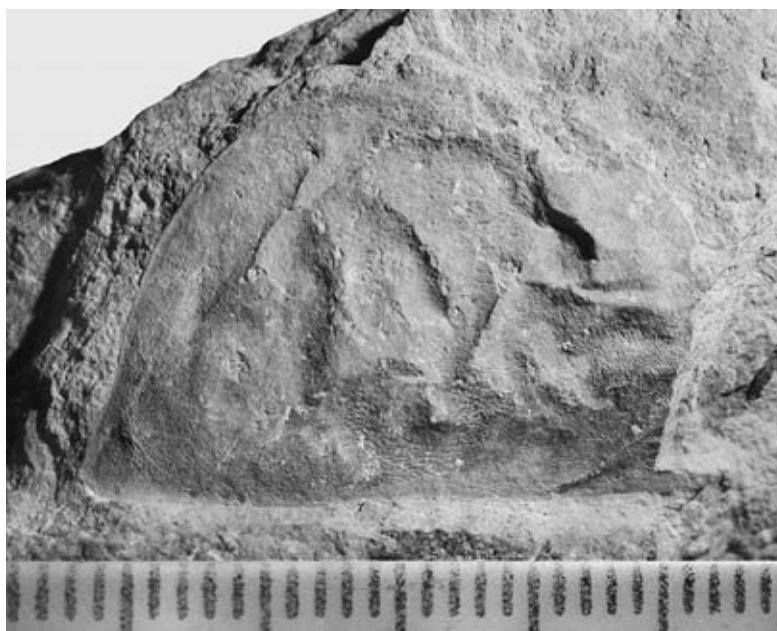
Fig. 1. Adelophthalmus irinae sp. nov.; holotype PIN, no. 5109/4: prosoma; scale-division value, 1 mm.