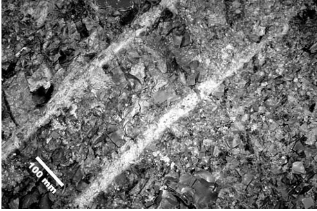
Fig. 1 Layer +19 (the white layer to the right of the scale) at the base of the bentonite series at Anthering (Salzburg, Austria)

The wide dispersal distance of the NAIP-ashes implies powerful phreatomagmatic eruptions, which supplied large volumes of pyroclastic material and volatile gases to the troposphere and stratosphere. In this study, we present the first calculations of the exceptional volumes of these early Eocene eruptions and we discuss the climate forcing effects of this major phase of explosive volcanism, which coincides with a short period of global climate cooling.