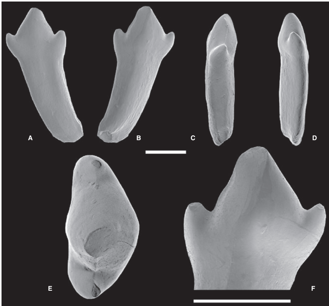
TEXT-FIG. 3. Scanning electron micrographs of BMNH M 45513 in A, lingual view; B, buccal view; C, distal view; D, mesial view; E, enlargement of crown in occlusal view; F, enlargement of crown in buccal view. Scale bars represent 500 \mu\text{m} .